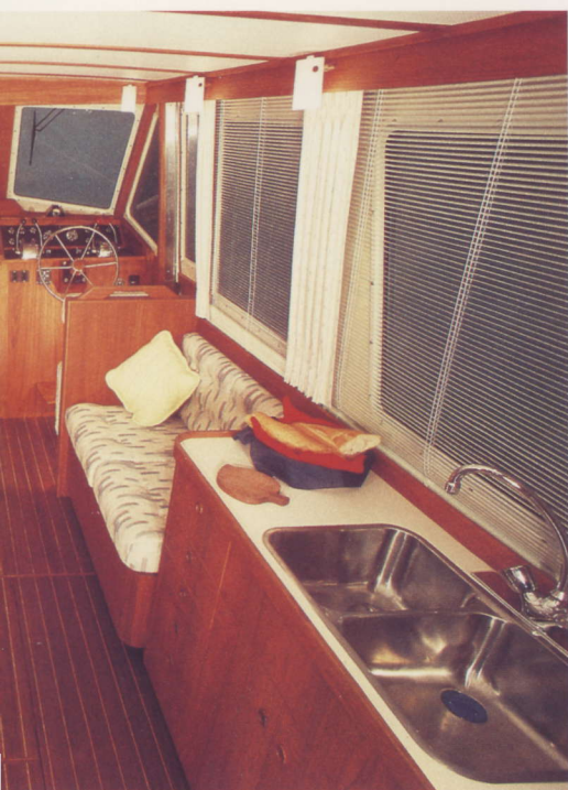
The main salon is open and spacious. Large windows all around provide excellent visibility and abundant natural light.

The inside control station offers excellent visibility, and has a sliding door to starboard for communicating with the crew. A large chart table to port and a pull-out shelf over the forward companionway keep navigation equipment close by.