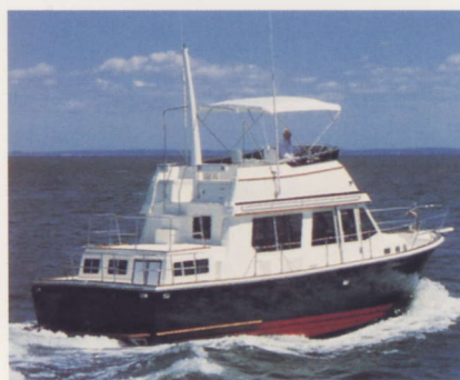
The L-shaped galley features a double, polished stainless steel sink and a three burner propane stove with oven, and electric refrigerator with freezer.