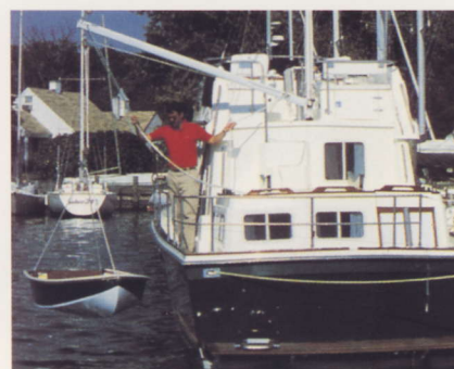
With the optional boom, launching a dingy is a simple and safe procedure.