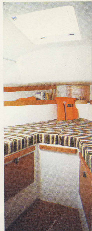
(Right) Heads and fore-cabin, showing fore-hatch.