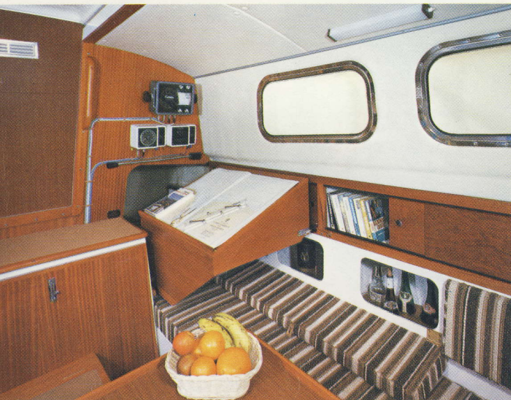
Main cabin, looking aft - Note chart table.

Choices: Ketch or Sloop rig; Aft or 'midships galley.