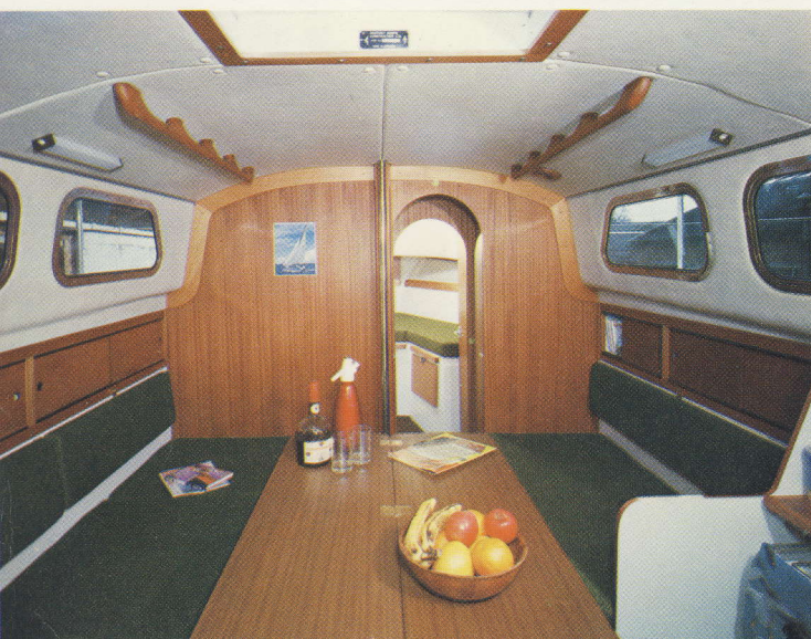
Main cabin, looking forward, aft galley.