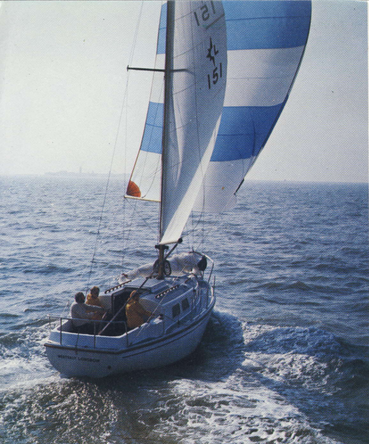
Sloop-rigged Longbow at sea.