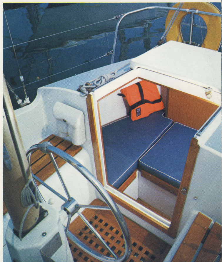
(Right) Aft cabin and hatch for cockpit.