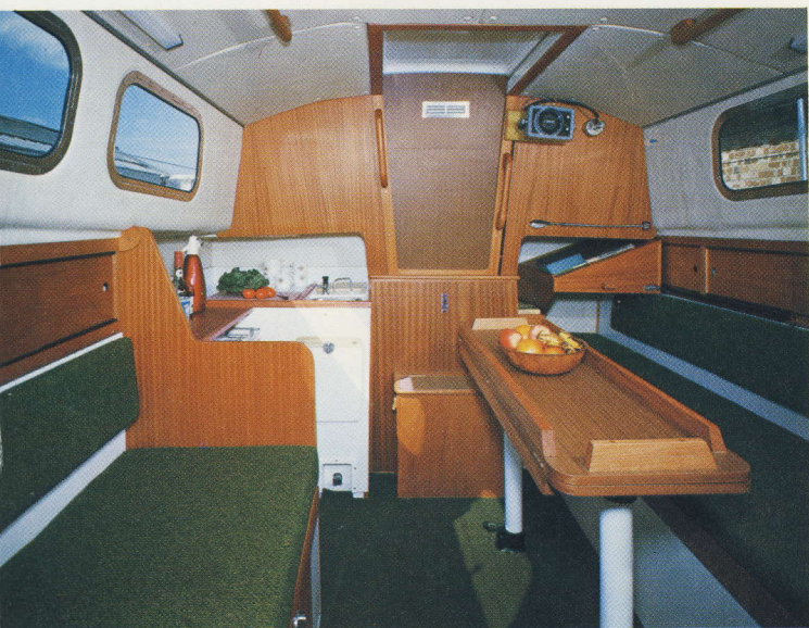
Main cabin, looking aft; aft galley.

Choices: Ketch or Sloop rig; Aft or 'midships galley.