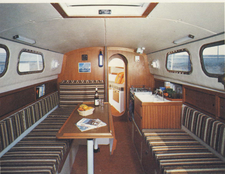
Main cabin, looking for'ard; midships galley.