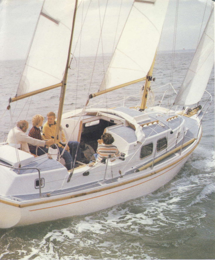
Ketch-rigged Pentland at sea.