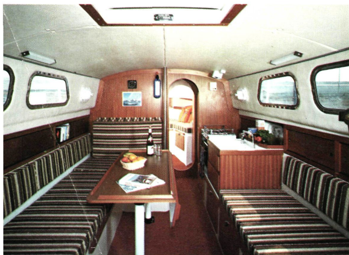
Main cabin, looking forward; midships galley.