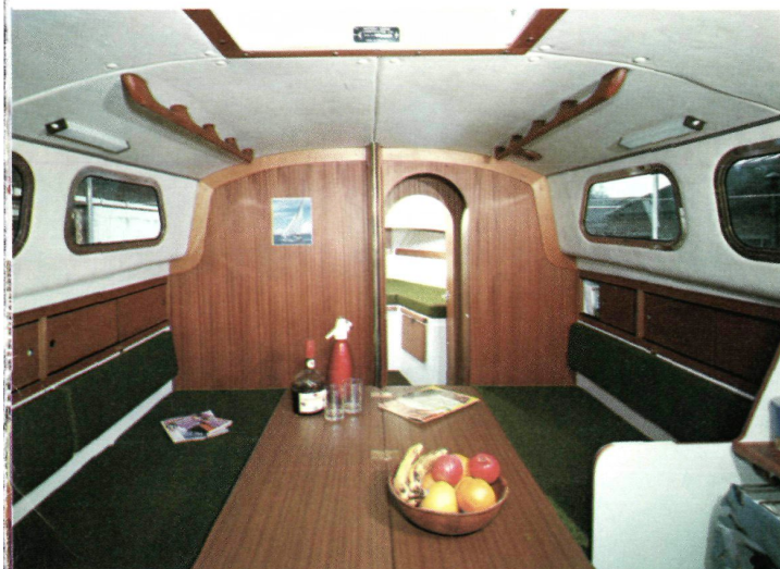
Main cabin, looking forward, aft galley.