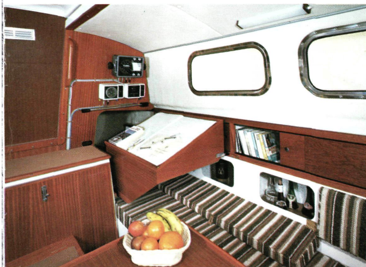
Main cabin, looking aft - Note chart table.

Choices: Ketch or Sloop rig; Aft or 'midships galley.