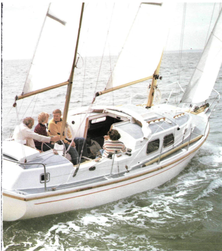
Ketch-rigged Pentland at sea.