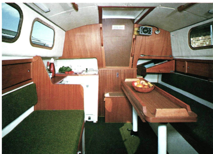
Main cabin, looking aft; aft galley.

Choices: Ketch or Sloop rig; Aft or 'midships galley.