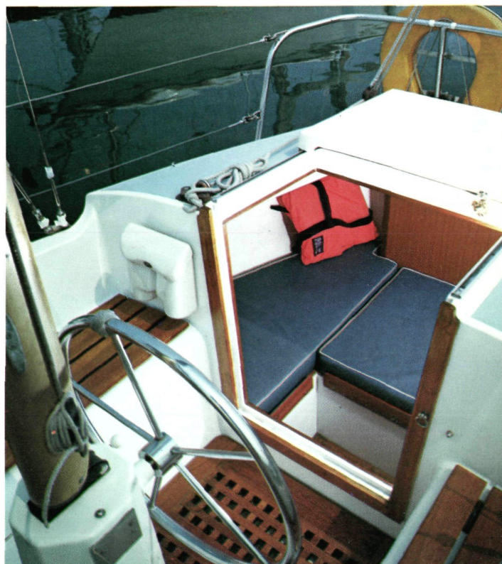
(Right) Aft cabin and hatch for cockpit.