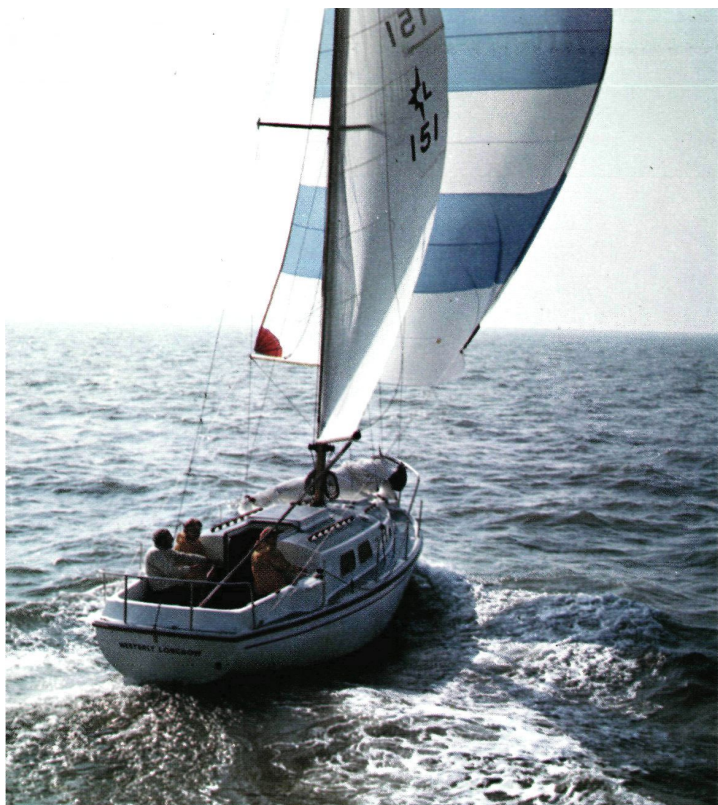
Sloop-rigged Longbow at sea.