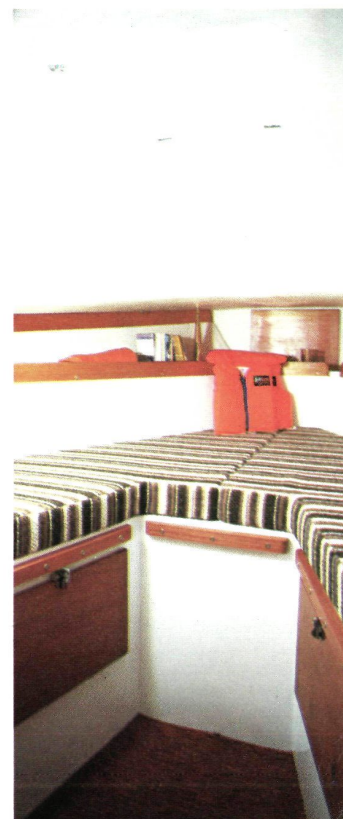
(Right) Heads and fore-cabin, showing fore-hatch.