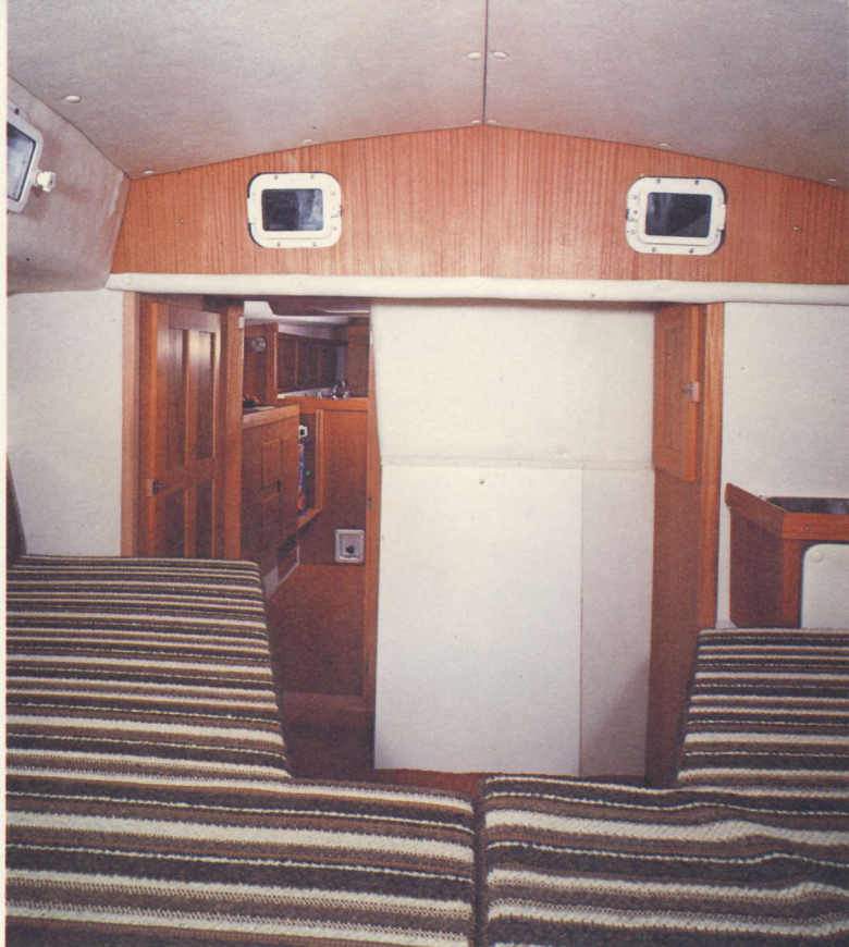
Aft cabin, showing door to walk-through

C. Galley to starboard, with passage berth.