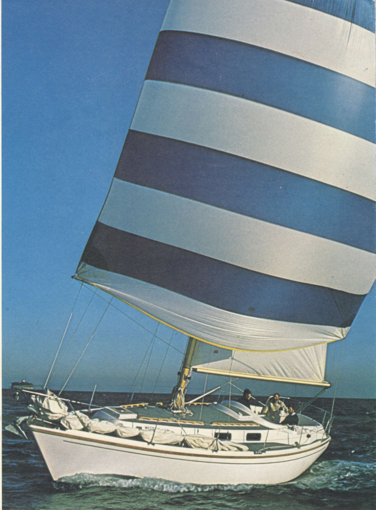
Sloop-rigged Medway at sea.