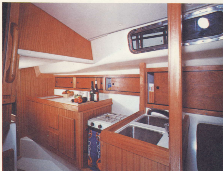
Galley area. 'B' layout.