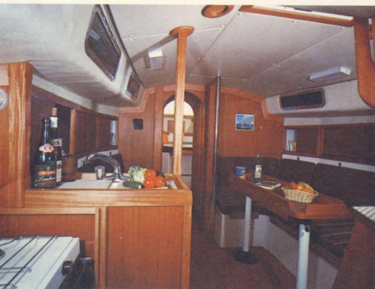
Main cabin, looking for'ard. 'B' layout.