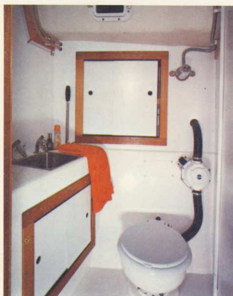
Heads - Note shower fitting.