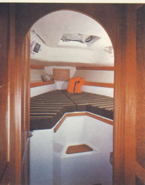
Forecabin, showing forehatch.