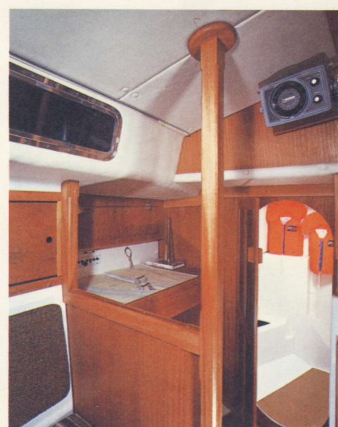
Chart table and sail locker. 'B' layout.