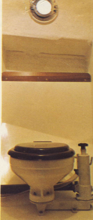
B Separate, properly ventilated head.