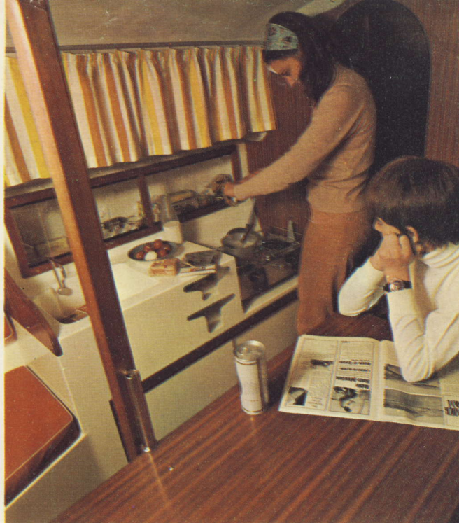
Superb galley, with everything you want where you want it. Plenty of storage, plenty of easy-to-clean working surface, and running water from a fresh water tank. Sailing wives and girlfriends should have things made easy for them!