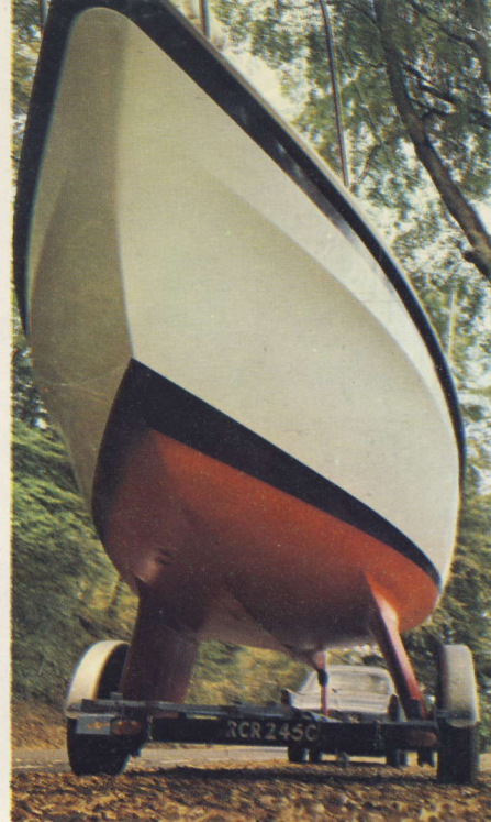
Twin keels make trailing easy! They also mean easier cruising in shoal water and safe drying out on a tidal mooring.