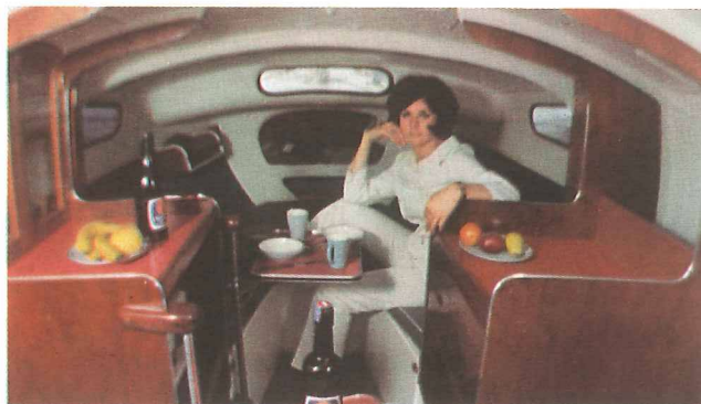
Comfortable living for four people inside the Westerly 22.

Yet another good reason for glass fibre. There's no caulking, no scraping to be done. Just a coat of anti-fouling on the bottom twice a year. And you won't ever need to paint your Westerly. Westerlys have a mirror-gloss finish that no paint can match.