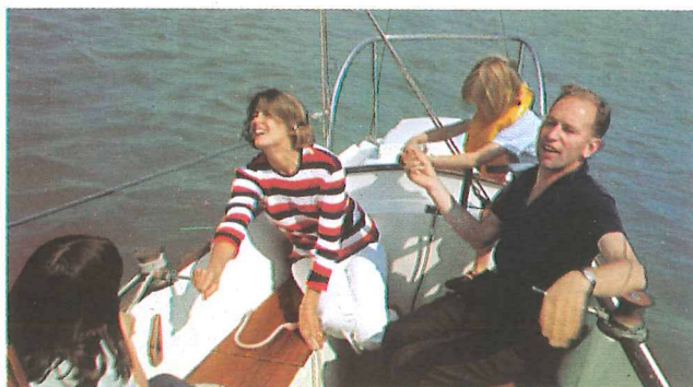
Westerly 25 has a deep cockpit – safe for children.

The type of boat you're proud to own – and others envy. Their beautiful, glass-smooth hulls (finished with Burma teak rubbing strips) make them look real beauties. Step aboard: you'll notice there's sufficient headroom in the cabin (rare in boats of this size). There's a wonderful impression of spaciousness. And fine attention to detail: comfortable sleeping berths; upholstered seats; plenty of shelf and hanging space; all fittings compact and cunningly stowed away; generous use of luxurious mahogany everywhere (features your wife will love). Westerly cabins have a charm not usually found in glass fibre boats.