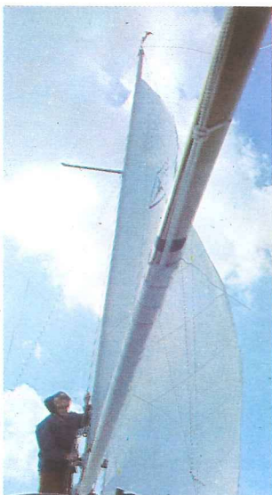
Even a girl can reef a Westerly single-handed. This is the 30.

Really experienced sailors enjoy sailing Westerlys. But the beauty of them is, you'll have no trouble handling one if you're out with an inexperienced crew. They'll soon learn the ropes. That's why Westerlys are real family boats. Everyone can participate: no-one gets left out of the fun. And they give you that feeling of confidence and security which is the basis of all enjoyment at sea.