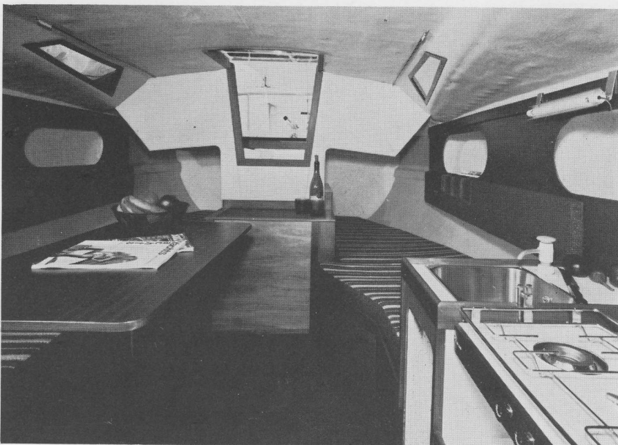
looking aft from the forecabin

The forward cabin which, in the Club Racing version, can be shut off from the main saloon by the folding door to the heads (marine WC) has a large 6 ft. double berth. Opposite the heads is a hanging space for clothing. The wood faced bulkheads and the extensive use of wood for fitting out, coupled with the perspex main and forward hatches and portlights, give a bright, airy and warm appearance to the interior of the GK24.