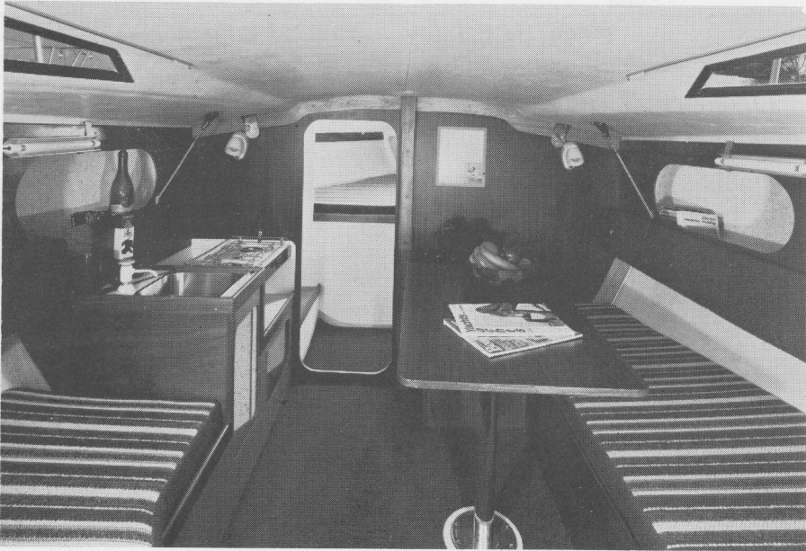
The saloon from the cockpit hatch

The saloon of the GK24 is surprisingly spacious having a beam of 9.26 ft. To starboard there is an L-shaped dinette which can be used as a child's berth if required. Aft of the dinette there is a full sized quarter berth. To port is the galley with its sink and piped water supply from a 5 gallon water container in the forepeak. Aft is another large quarter berth. Ample shelf and berth lockers provide full inventory stowage space.