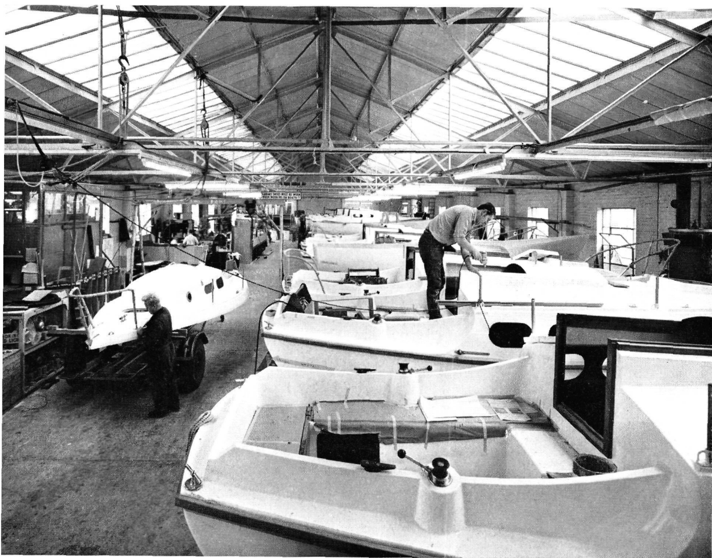
Westerlys in the assembly line at the Waterlooville factory

Perhaps it is worth mentioning here that the Centaur is from the same stable as the fin keel 22 foot Westerly Cirrus, unanimous winner of the "Yachting World" ONE-OF-A-KIND Rally in 1968. Quality in performance and design were among the key factors and the judges reported that it was the boat that "most successfully fulfilled its design intention and offered good value for money – a product of a great deal of intelligent thought".