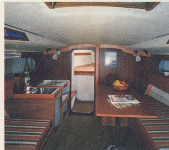
The saloon from the cockpit hatch

The forward cabin which, in the Club Racing version, can be shut off from the main saloon by the folding door to the heads (marine WC) has a large 6ft. double berth. Opposite the heads is a hanging space for clothing. The wood faced bulkheads and the extensive use of wood for fitting out, coupled with the perspex main and forward hatches and portlights, give a bright, airy and warm appearance to the interior of the GK24.