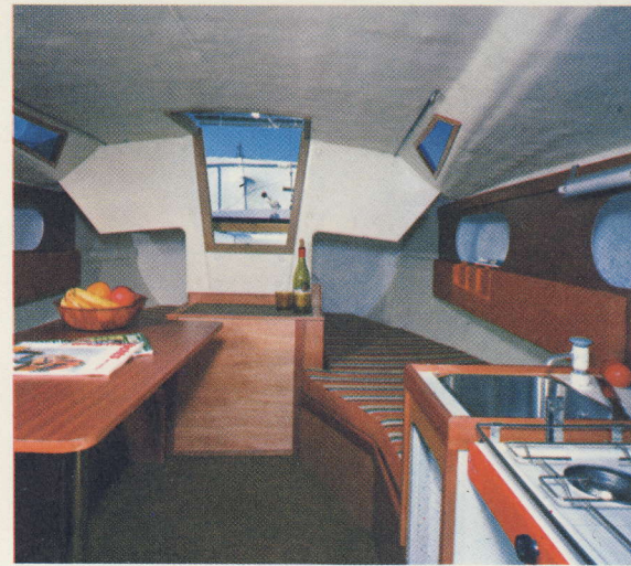
looking aft from the forecabin

The forward cabin which, in the Club Racing version, can be shut off from the main saloon by the folding door to the heads (marine WC) has a large 6ft. double berth. Opposite the heads is a hanging space for clothing. The wood faced bulkheads and the extensive use of wood for fitting out, coupled with the perspex main and forward hatches and portlights, give a bright, airy and warm appearance to the interior of the GK24.