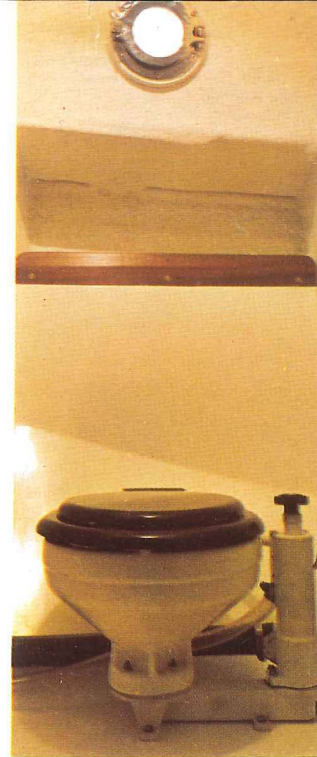
B Separate, properly ventilated head.

indeed (padded seat backs) for eating, or for lolling about in between times. And you could use the dinette as a double berth—making five in all!